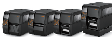
Standard Auto cutter Peeler Rewinder + Peeler